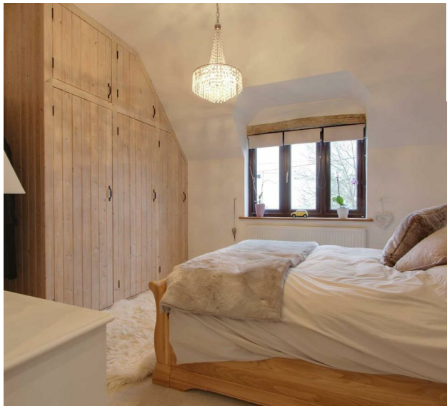
A stunning semi detached Rothschild cottage in the heart of Wingrave with stunning views to the front over countryside and towards the Chilterns beyond.